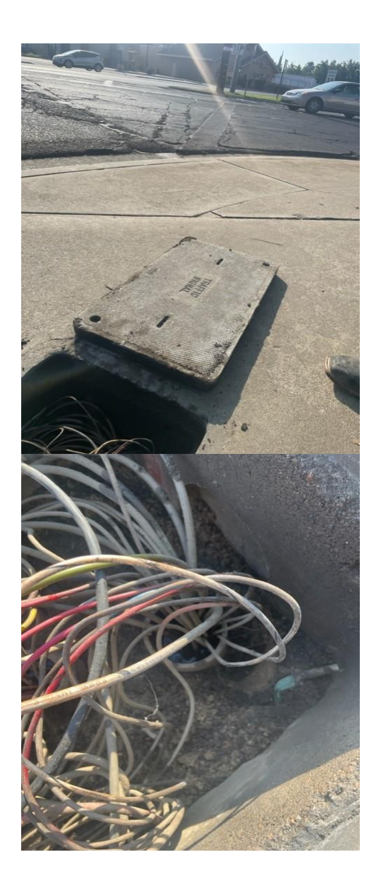
Page 4 of 6