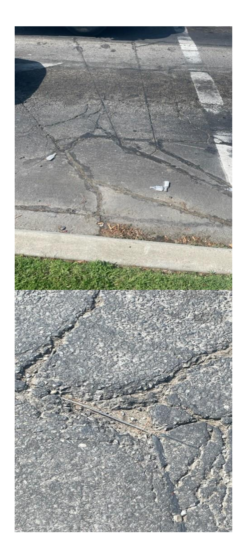
Page 3 of 6